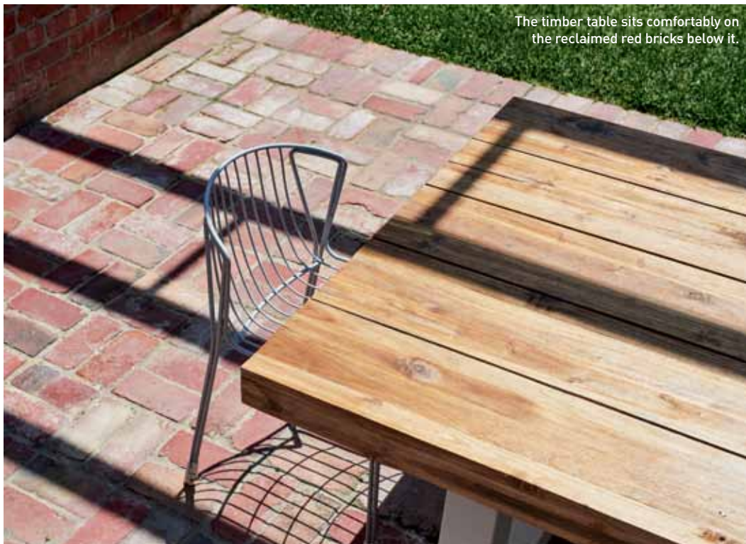
The timber table sits comfortably on the reclaimed red bricks below it.