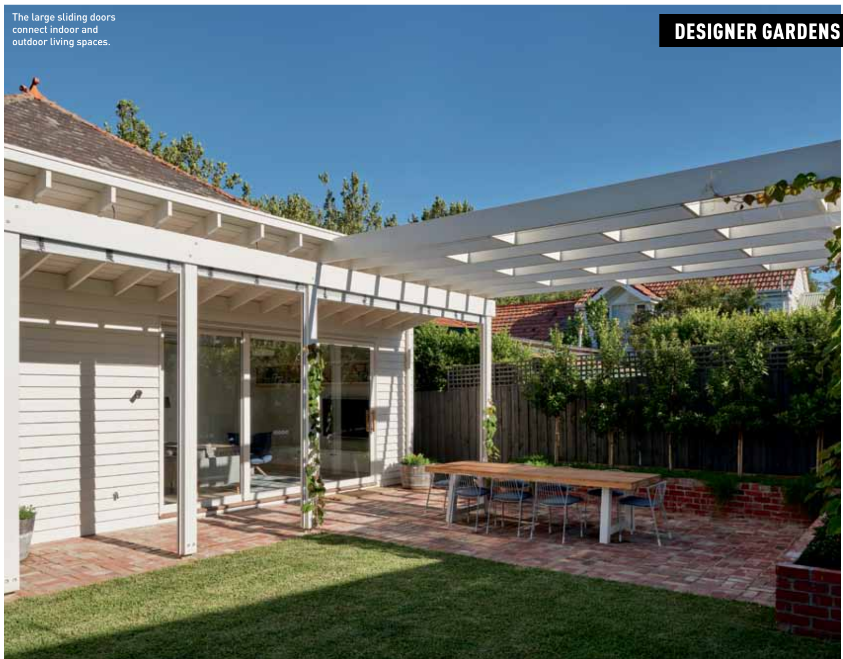
The large sliding doors connect indoor and outdoor living spaces.