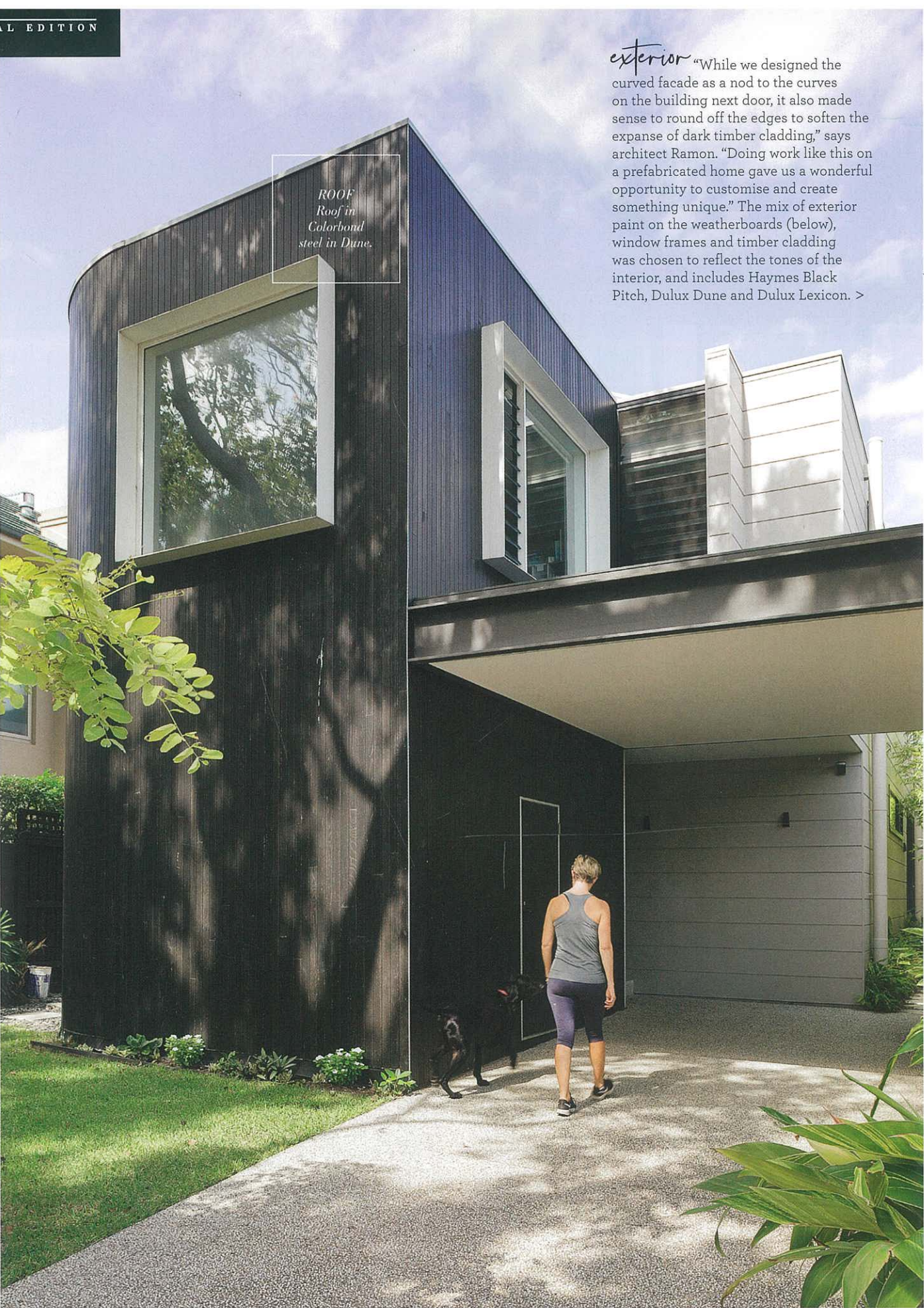
ROOF Roof in Colorbond steel in Dune.

“While we designed the curved facade as a nod to the curves on the building next door, it also made sense to round off the edges to soften the expanse of dark timber cladding,” says architect Ramon. “Doing work like this on a prefabricated home gave us a wonderful opportunity to customise and create something unique.” The mix of exterior paint on the weatherboards (below), window frames and timber cladding was chosen to reflect the tones of the interior, and includes Haymes Black Pitch, Dulux Dune and Dulux Lexicon. >